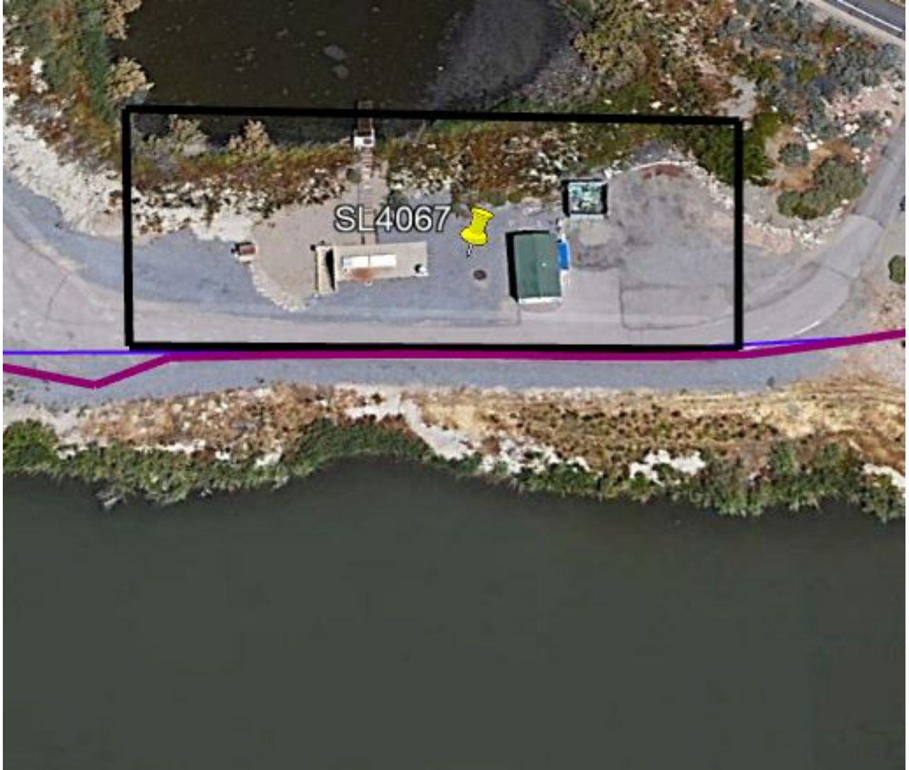
3) Footprint Map